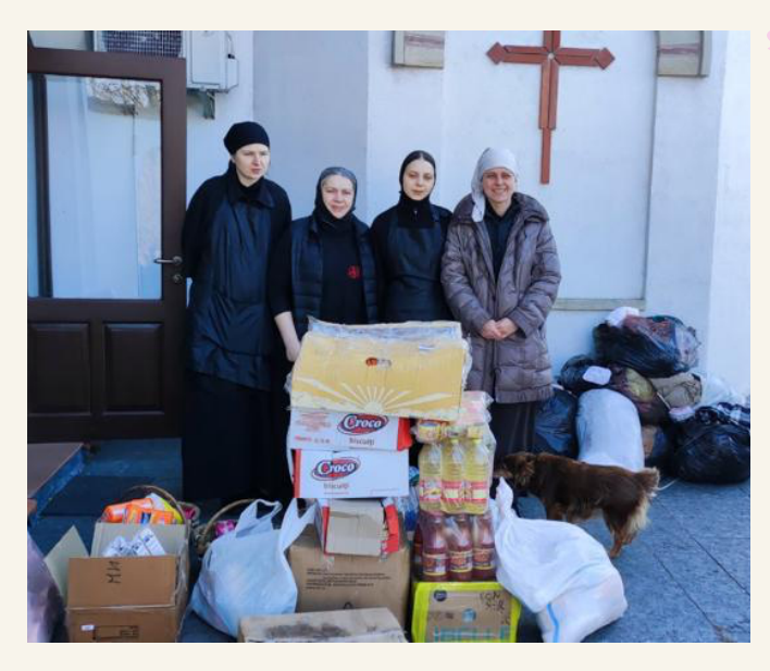
These supplies were bought thanks to you!

May you have a joyous Pascha despite all the suffering that is going on in the world. Thank you for opening my letter. I have so much to tell you about what beautiful things you have done!